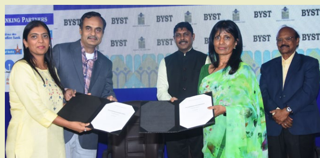
Launch of DIGITAL GRAMPRENEUR DEVELOPMENT PROGRAM with CISCO

Bharatiya Yuva Shakti Trust and CISCO joined hands to support Grampreneurs® from vulnerable socio-economic backgrounds in Chennai and Faridabad. The programme will provide training to strengthen the 'digital-readiness' of BYST entrepreneurs.