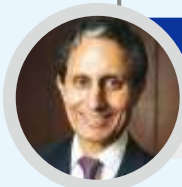
Mr C K Birla