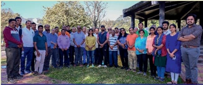
Get-together of mentors from Satara, Kolhapur, Sangli, Aurangabad, Wardha, Sikar and Udham Singh Nagar

Building an effective entrepreneurial ecosystem through experience sharing by mentors