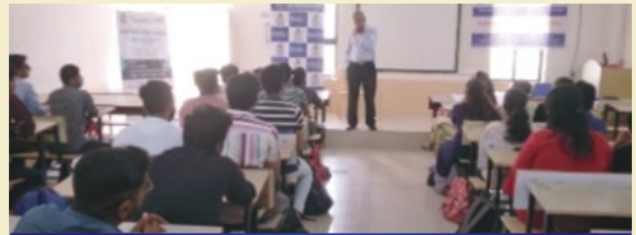
Senior mentors of BYST conducting EOL

BYST's Entrepreneur Online Learning (EOL) programmes address the challenges faced by Grampreneurs® in their entrepreneurial journeys and provide a pathway to overcome them. Various business aspects were highlighted during the recent session of EOL conducted BYST at Chintamanrao Institute of Management College, Sangli. It was attended by 46 potential entrepreneurs and was a huge success.