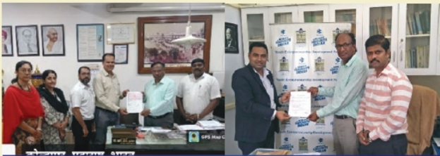
BYST partnered with ITI and Vivekananda colleges

BYST has entered into new partnerships with ITI, Aurangabad, Vivekananda College, Kolhapur to support aspiring entrepreneurs from underprivileged communities by signing Letters of Cooperation.