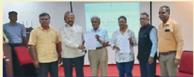
LOCs signed with Action Aid Association & TN workers Welfare Trust

BYST partnered with Action Aid India & Tamil Nadu Domestic Workers Welfare Trust on 20th & 21st April 2023 by signing Letters of Cooperation at Chennai.