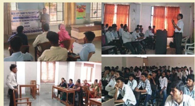
BYST's senior mentors conducting AGP at Sikar, Aurangabad and Wardha

BYST conducted Awareness Generation Programmes in Grampanchayat, Gokulpura, Sikar, CSMSS College of Polytechnic, Aurangabad, Gramupyogi Science Centre, Wardha and many other regions with a goal to support budding entrepreneurs from underserved areas in securing a bank loan, elevate marketing skills, mentoring, counselling and more.