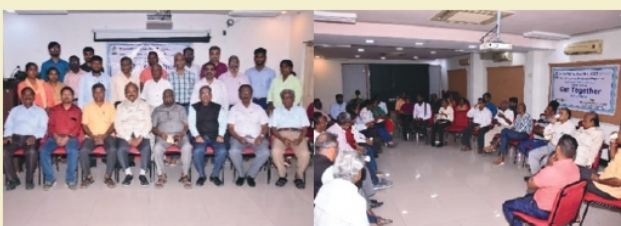
Mentors and Mentees at Chennai and Faridabad sharing thoughts on the importance of digital tools in business

Bharatiya Yuva Shakti Trust organized Mentor Chapter meeting under 'Digital Grampreneur® Development Programme' supported by CISCO at Chennai and Faridabad clusters. It is a platform for mentors and mentees to share new aspects of business. The get-together opened new avenues for next-generation entrepreneurs focusing on the utilization of digital tools in business. BYST's senior mentors conducted brainstorming sessions to discuss technological advancement strategies for reaping better profits in future. Also, another meeting supported by Bajaj Auto and BYST held at MCCIA Hall Pune.