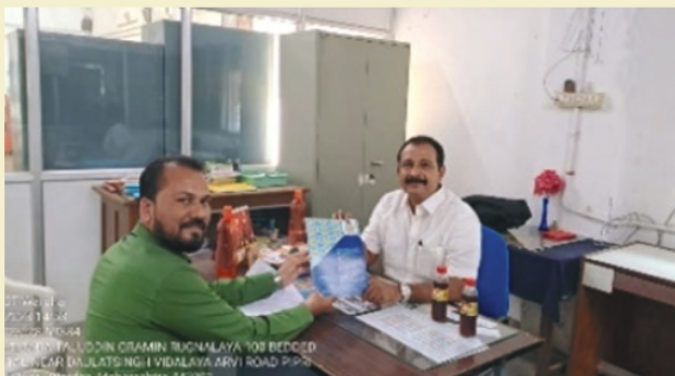
New mentor induction at Sikar

Stepping forward towards our goal, new mentors from Sikar and Wardha have become part of BYST family and ready to inherit our ancient tradition of Guru Shishya Parampara to next-generation entrepreneurs.