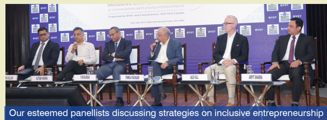
Our esteemed panellists discussing strategies on inclusive entrepreneurship

A panel discussion on inclusive entrepreneurship brought together industry experts to explore strategies and opportunities for promoting diversity and inclusivity in the entrepreneurial ecosystem. The session aimed to inspire and empower entrepreneurs from diverse backgrounds, fostering a more equitable and accessible entrepreneurial landscape.