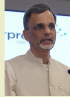
Dr. V. Anantha Nageswaran Chief Economic Advisor Government of India

“Young entrepreneurs from G-20 countries should collaborate in curating interventions that will strengthen and diversify global value chains in the MSME sector, which were particularly disrupted during COVID-19 pandemic. Women-led enterprises are disproportionately affected by credit constraints and gender barriers. To mitigate the burden of trade costs on young entrepreneurs, collective action by the global community is the need of the hour. The Government of India is committed to introducing global best practices for ensuring Indian MSMEs are seamlessly integrated into global value chains.”