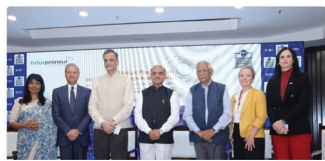
THE ECONOMIC TIMES News