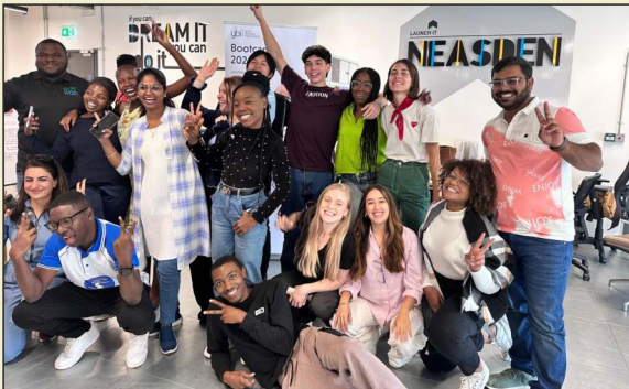
Networking session at YBI Bootcamp, London

One of the most memorable moments for me was the networking session at the House of Parliament in London. The opportunity to connect with peers and business leaders in such an iconic setting was surreal. This session opened doors to new connections and collaborations, which I believe will help me grow both personally and professionally.