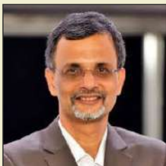
Dr. V. Anantha Nageswaran Chief Economic Advisor Government of India