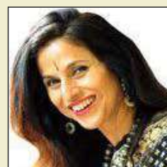
Ms. Shobhaa De Columnist and Social Commentator