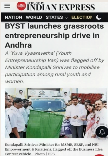
Youva Vyaparitva Ratham flagged off in Vijayawada

Youva Vyaparitva Ratham — Youth Entrepreneurship Van, Vijayawada Partners: BYST · Government of Andhra Pradesh · Cisco India CSR