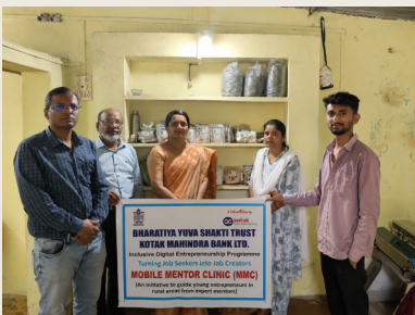
Mentor Mobile Clinic, Maharashtra

This is BYST mentoring at work — solving real problems on the ground and building networks that endure