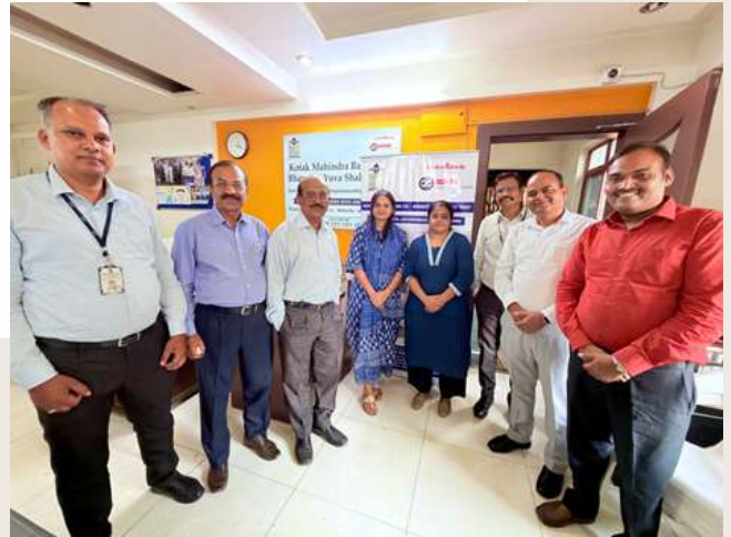
Kotak Mahindra Bank CSR team with the BYST team, Pune

BYST is grateful to Kotak Mahindra Bank for its continued partnership and engaged guidance, which keeps the programme sharp, accountable and focused on lasting entrepreneurial impact.