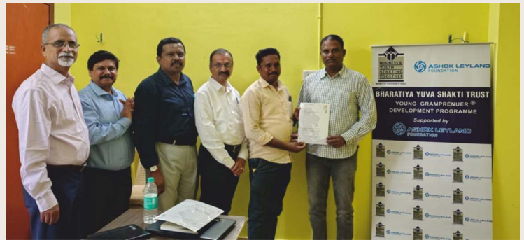
Ashok Leyland Foundation CSR team with BYST entrepreneurs and mentors, Kolli Hills

BYST is grateful to the Ashok Leyland Foundation for its continued partnership and guidance, which turns local potential into lasting livelihoods across Kolli Hills.