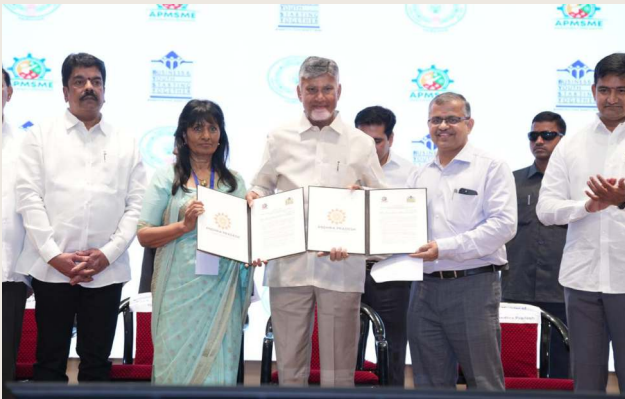
Hon'ble CM Shri Nara Chandrababu Naidu with BYST at the One Family – One Entrepreneur MSME Growth Summit 2026, Vijayawada

Against the grand backdrop of the One Family – One Entrepreneur MSME Growth Summit 2026 in Vijayawada, a flagship Andhra Pradesh summit dedicated to micro and small enterprise, the Government of Andhra Pradesh exchanged a Memorandum of Understanding (MoU) with BYST in the distinguished presence of Hon'ble Chief Minister Shri Nara Chandrababu Naidu. The MoU was formally exchanged amid a celebration of enterprise, a landmark moment for grassroots entrepreneurship in the state.