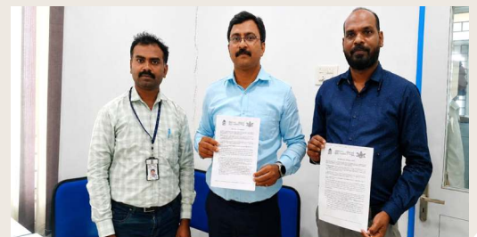
LoC Signing with MIC Engineering College, Vijayawada