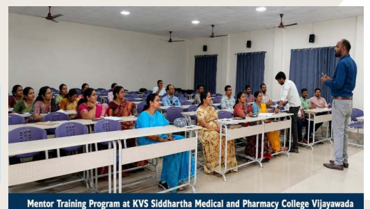
Mentor Training Program at KVS Siddhartha Medical and Pharmacy College Vijayawada

“Thanks to BYST for the two-day training programme. As we work with SHGs, the mentor's role is vital. We learned there is a structured mentoring process that helps grow tiny entrepreneurs into micro entrepreneurs.”