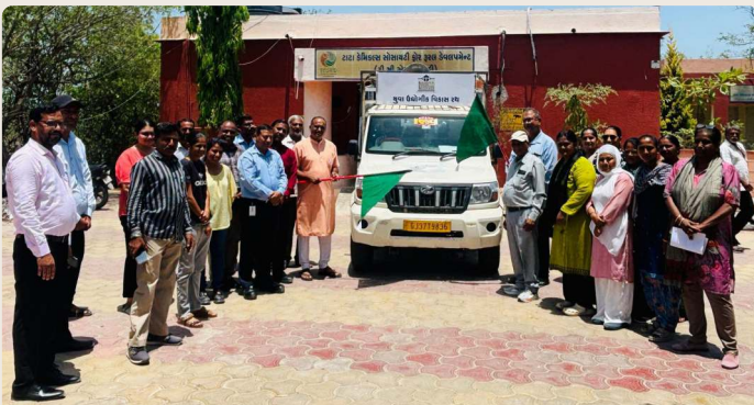
Yuva Udyogi Rath flagged off from the TCSR Office, Mithapur

Partners: BYST · TCSR (Tata Chemicals Society for Rural Development)